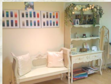
Image Consultancy: 075 4022 1044